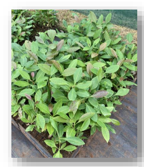
Arillastrum gummiferum (Myrtaceae)

Germination rate = 30 to 80% Seedlings transfer = 90% survival