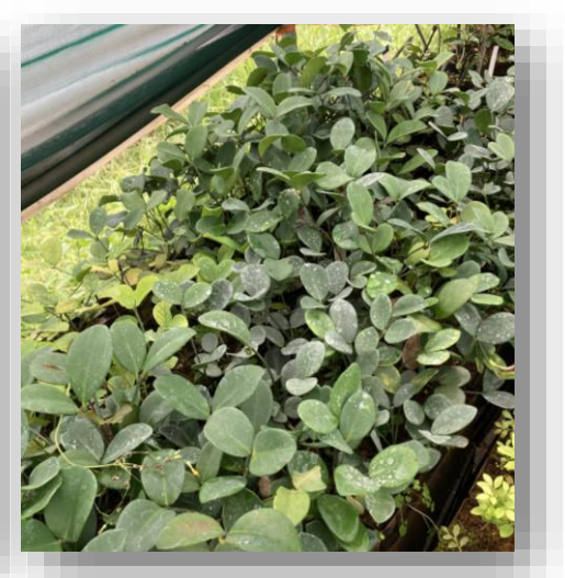
Dendrophyllanthus conjugatus var. conjugatus (Phyllanthaceae) Cuttings viability = 74% Seedlings transfer = 85% survival

Germination rate = 30 to 80% Seedlings transfer = 90% survival