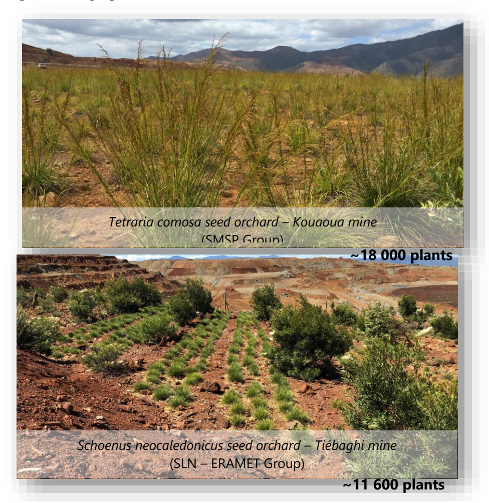
Figure 3. Two of the seed orchards created on mining sites : Kouaoua mine (SMSP group) and Tiébaghi mine (SLN-ERAMET Group).

orchards have been implemented in different locations ( Fig. 3 ).