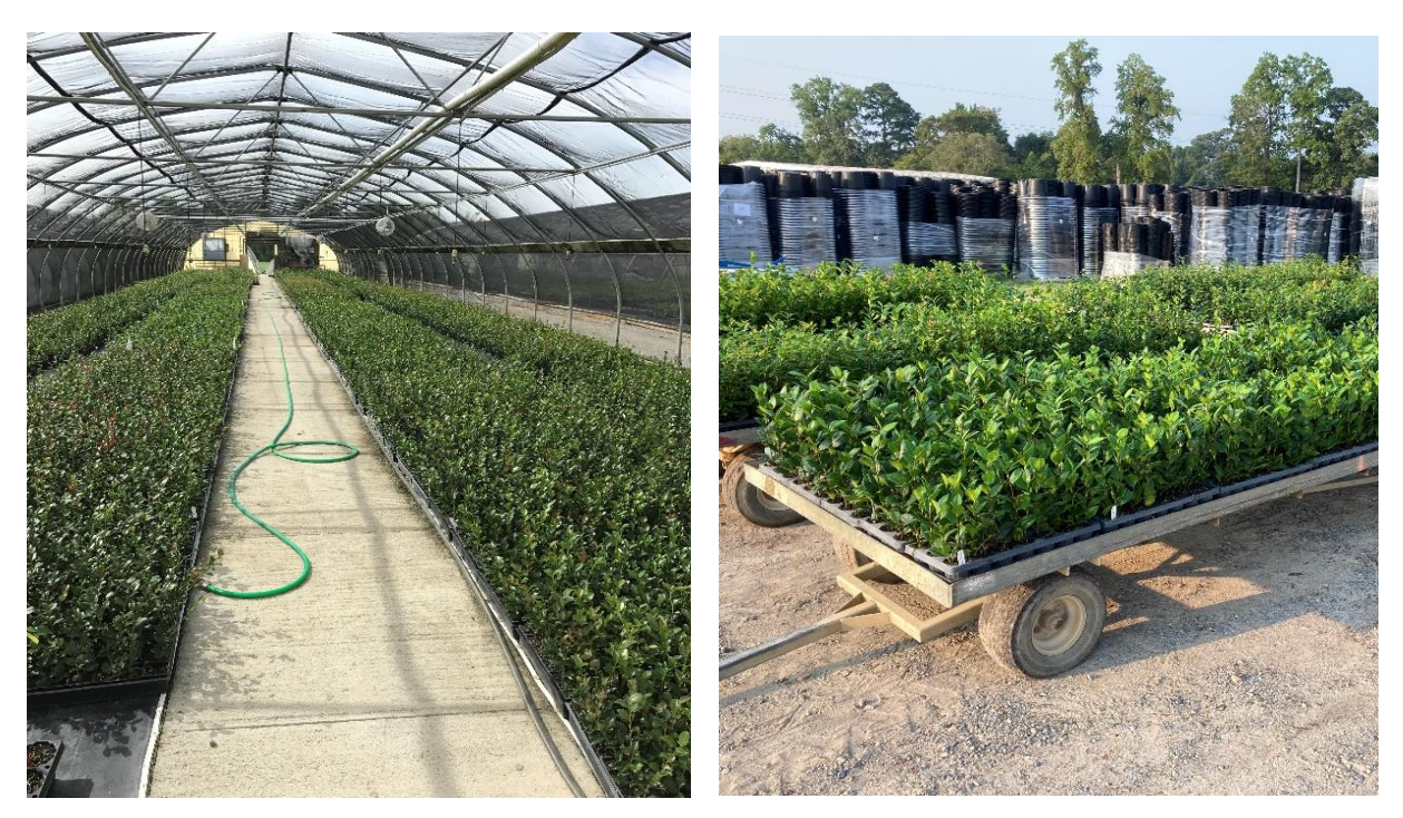
Figure 27. (left) Finished liners ready to pot into one-gal or three-gal containers, and (right) finished liners loaded onto trailers for transport to potting facility.