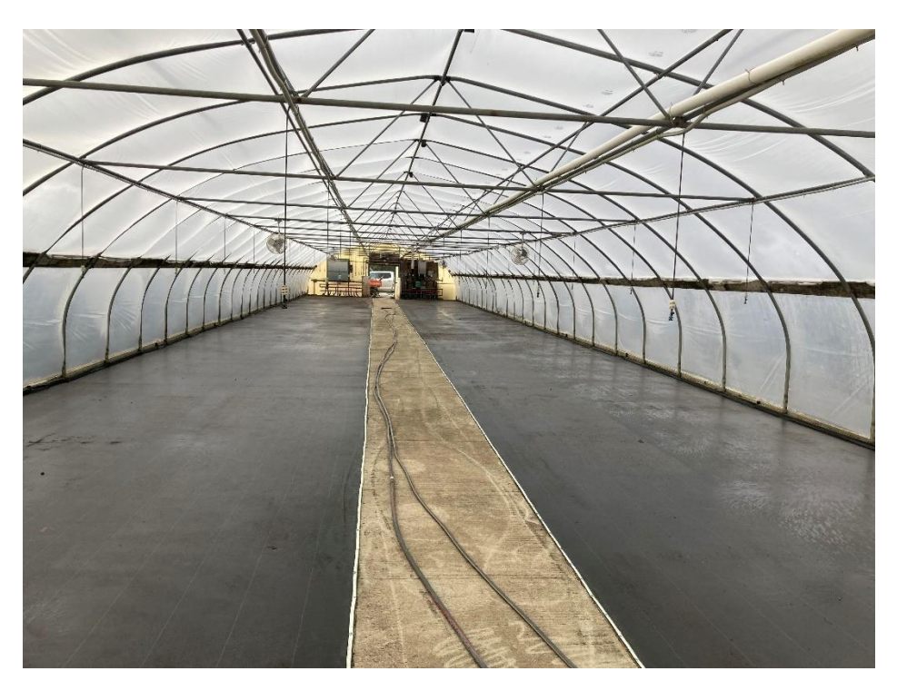
Figure 23. Interior view of clean and sanitized propagation house.

for weeds, followed by timely hand weeding is necessary to manage weeds effectively.