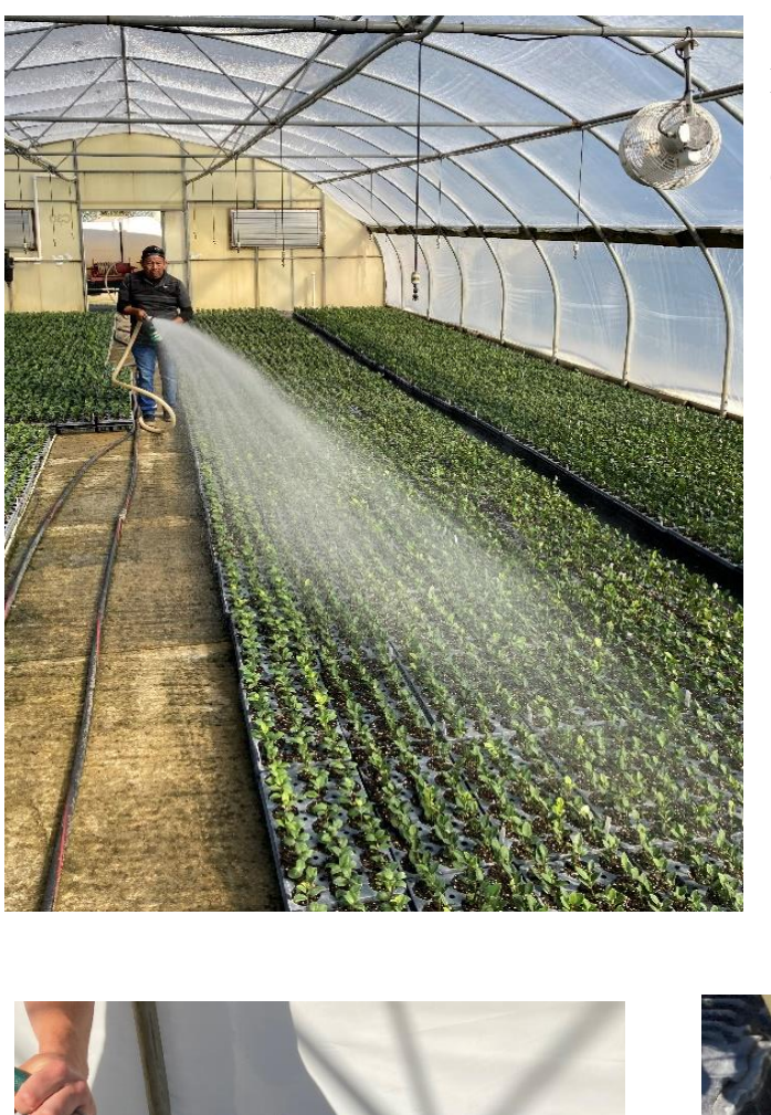
Figure 20. Drench application of watersoluble fertilizer to rooted cuttings to encourage healthy root development.