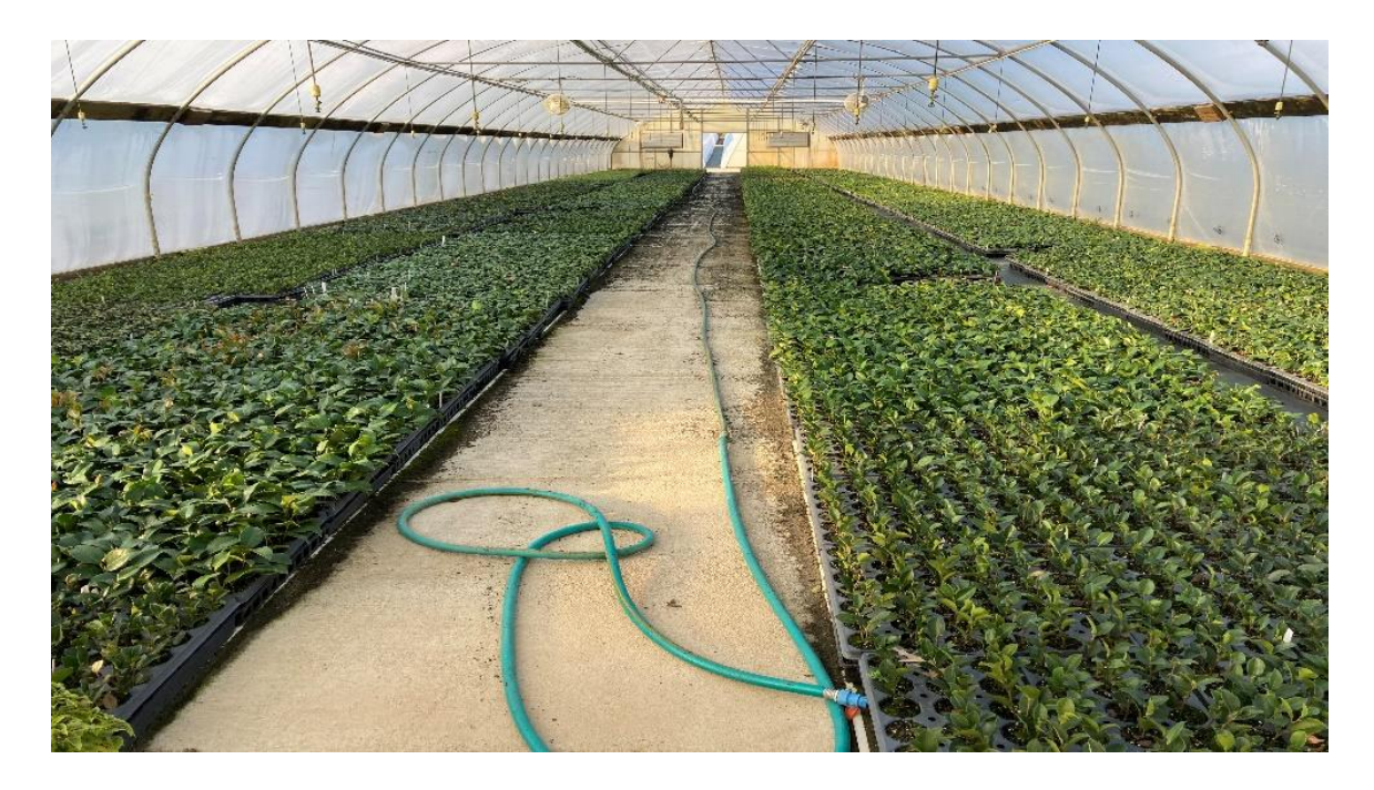
Figure 19. A 9x44 m (30x145 ft) greenhouse of rooted cuttings.