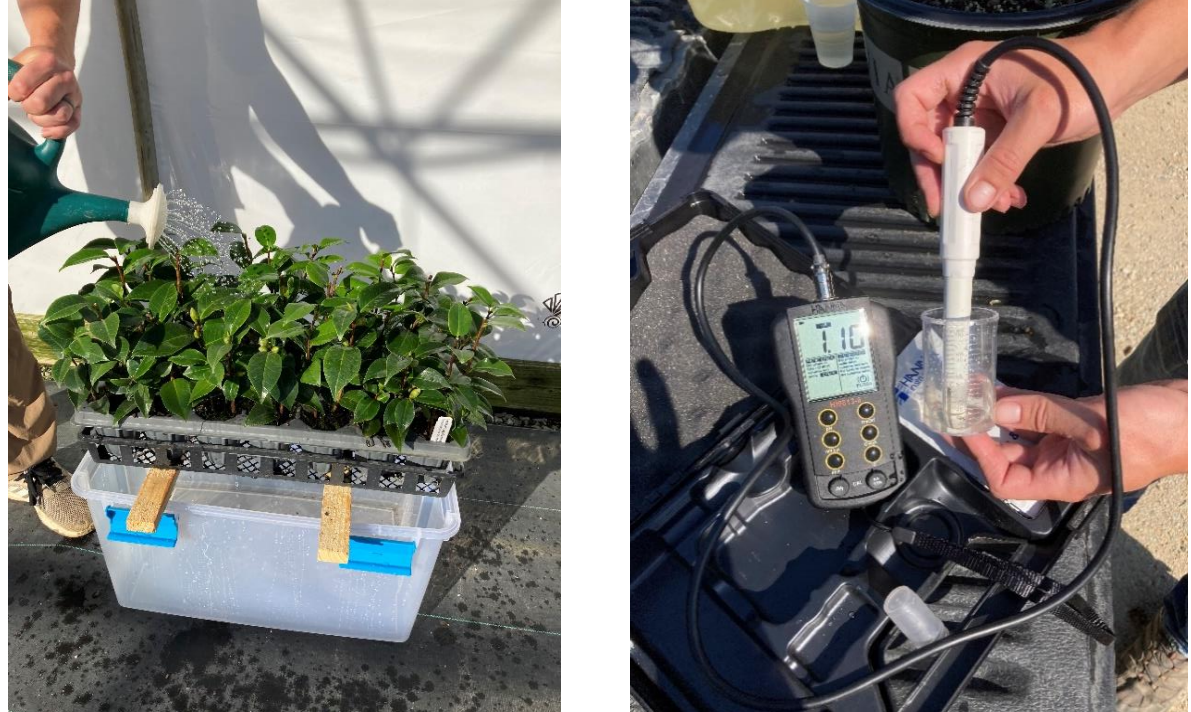
Figure 21. (left) Applying water to rooted cutting in order to provide leachate for analysis, and (right) measuring electrical conductivity and pH data of leachate to determine fertility level.