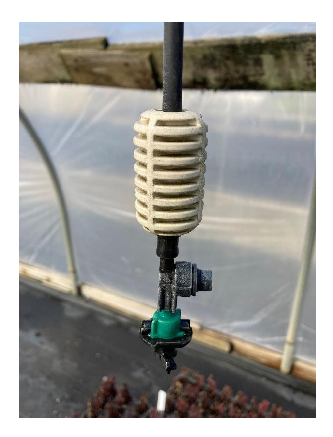
Figure 16 . (Top, bottom left) Mini-Sprinklers are manufactured by Tavlit<sup>®</sup>. They are the 866 mini-compact sprinklers and can accommodate a variety of color-coded spinners which have different flow-rates. (Bottom right) An anti-drip device is included in the design to quickly discontinue the misting event.