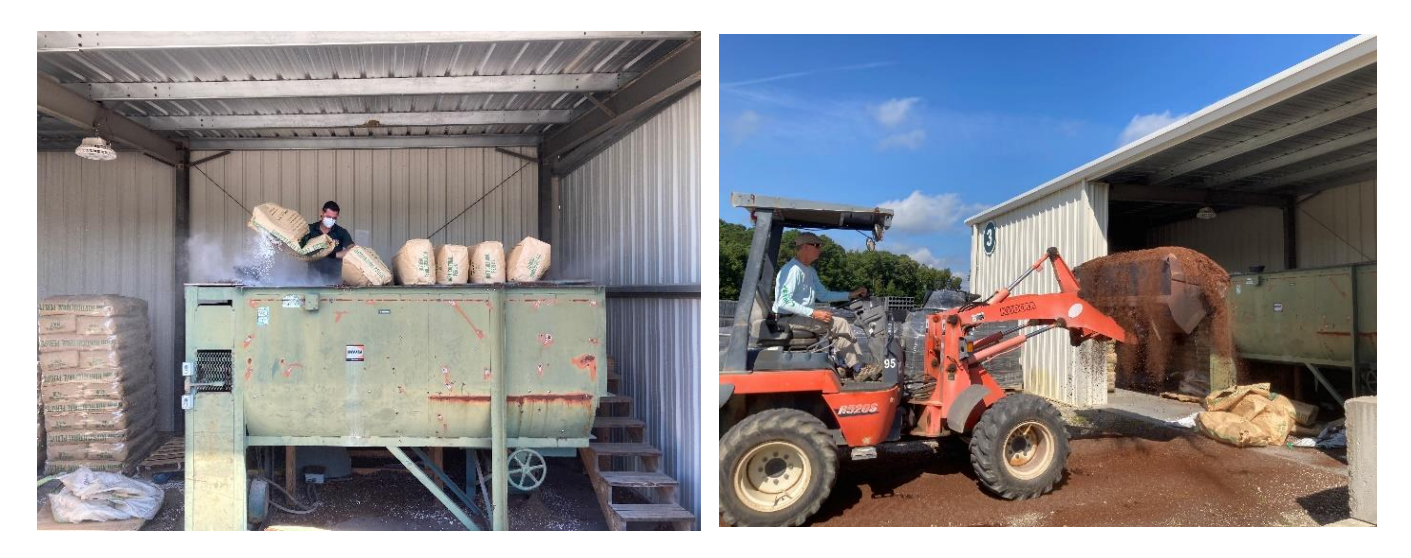
Figure 9. (left) Loading course perlite into 3.8 \text{ m}^3 (5 yd<sup>3</sup>) paddle mixer, and (right) loading bulk aged loblolly pine bark into the paddle mixer.