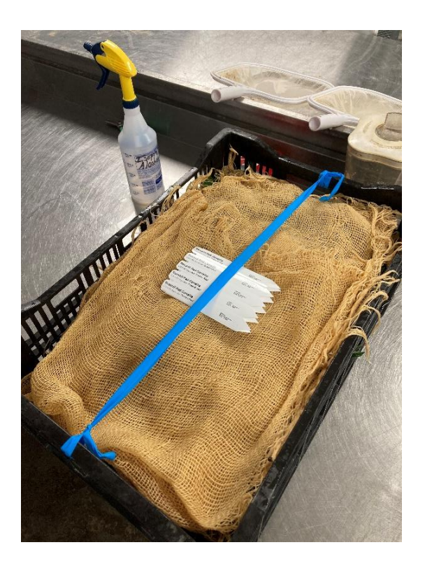
Figure 7. (left) Basal dipping bundles of cuttings with auxin solution, and (right) a finished crate of auxin-treated cuttings ready to stick.

crate, draped with damp burlap, and color coded with ribbon tied across the prepared crate (Fig. 7). The colored ribbons are a good visual aid for preventing mixing of cultivars (Fig 7).