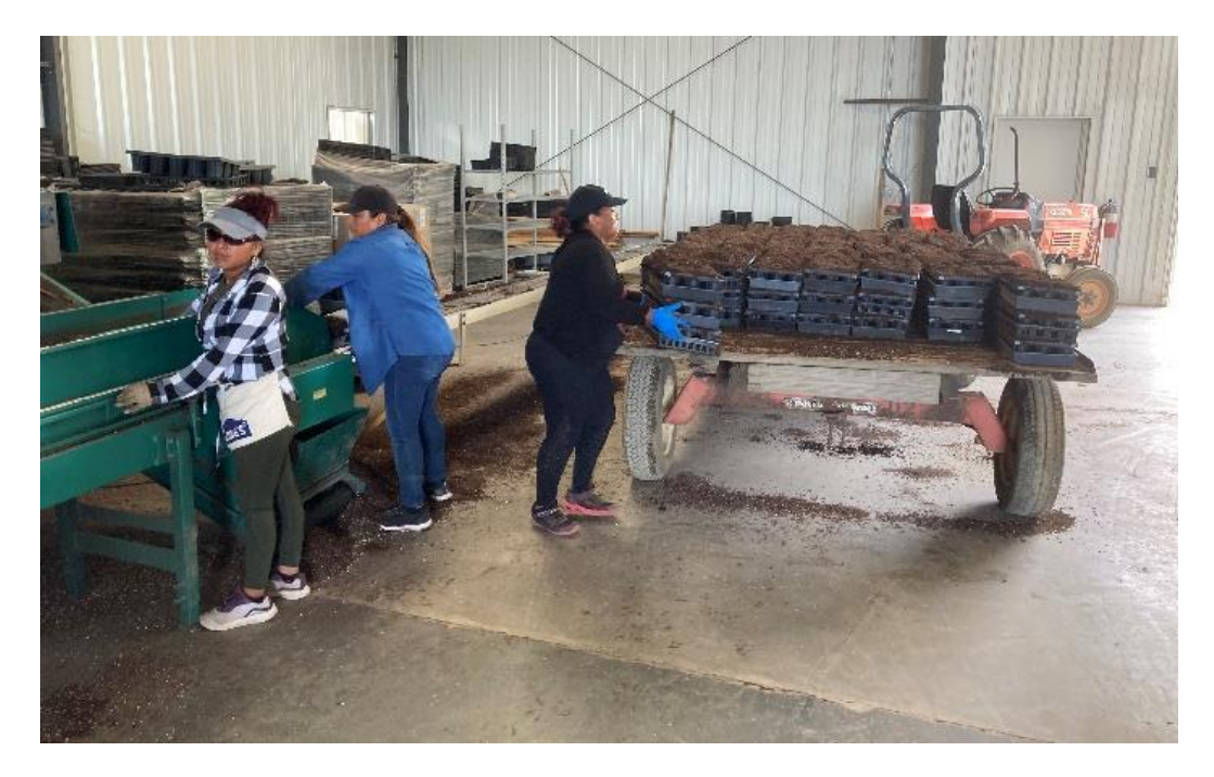
Figure 10. Filling trays with rooting substrate.

they are triple stacked on the trailer for transport to the greenhouses (Fig. 10).