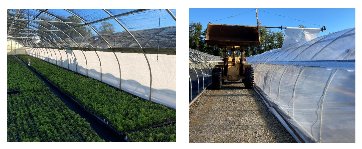
Figure 12. (left) A 9x44 m (30x145 ft) greenhouse covered with 50% shade cloth and 2 m (6-ft) plastic side curtains. (right) Applying a double layer of clear plastic to greenhouse using boom attachment.

Ambient air temperature is maintained below 29 C° (85°F) by a thermostatically controlled vent fan. In addition, each greenhouse is equipped with a propane fired hot water in floor heating system to maintain 21 C° (70°F) in the rooting substrate (Fig 13).