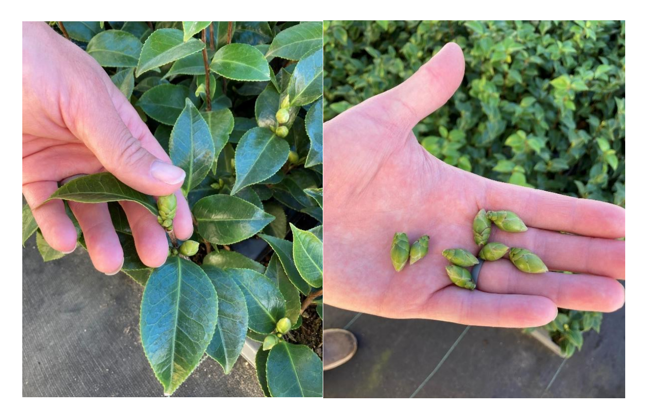
Figure 25. (left) Disbudding flower buds on rooted cuttings, (right) removed flower buds.

prevents botrytis blight on open flowers in the mist bed. Another round of disbudding is performed after cuttings have rooted and before the first flush of growth in the spring.