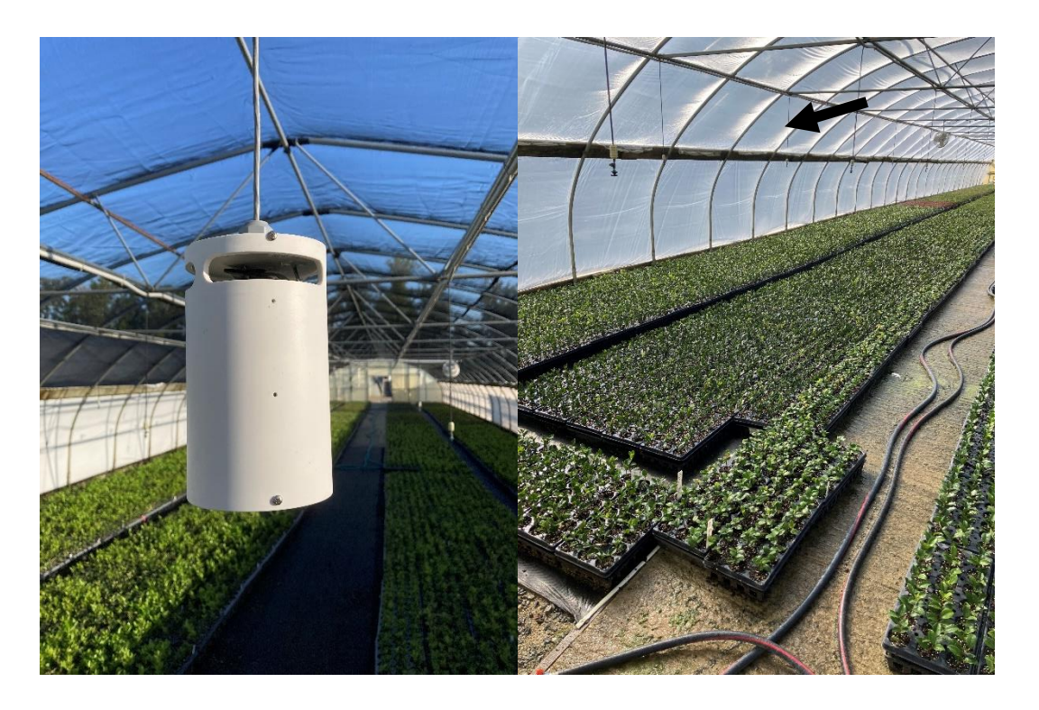
Figure 15. (left) A data collector unit, and (right) a propagation house of recently stuck camellia cuttings with misting heads (Mini-Sprinklers) mounted overhead and inverted on weighted drop tubes (arrow).