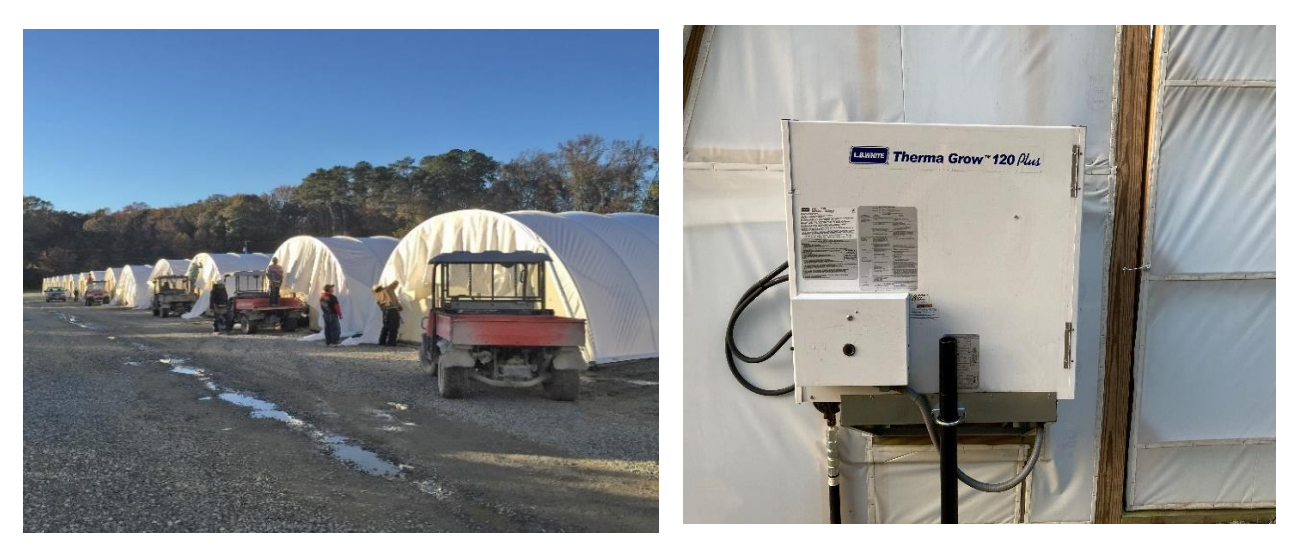
Figure 22. (left) Covering greenhouses with 50% opacity plastic for winter protection, and (right) outdoor mounted, direct fire, forced air heat for high efficency heating.

the greenhouse will provide adequate protection to well acclimated rooted cuttings (Fig. 22). Upon acclimation, the rooted cuttings are transferred to an overwintering house. White overwintering plastic provides 50% shade during the dormant season. The white plastic is removed and replaced with 50% shade cloth after the frost-free date.