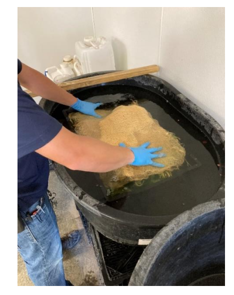
Figure 6. (left) The oxidizing agent, Jet-Ag<sup>®</sup>, (right) a 19 L (5-gal) container of the hydrogen peroxide-based Jet-Ag<sup>®</sup> solution with a submerged crate of camellia bundles.