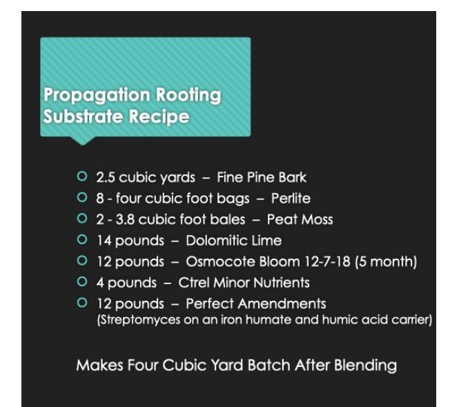
Figure 8. Blended ingredients to produce the rooting substrate.

The components of the propagation rooting substate are detailed in Fig. 8. The rooting substrate is prepared daily in a 3.8 \text{ m}^3 (5 \text{ yd}^3) paddle mixer. A front loader is used to load the bulk aged pine bark (Fig. 9).