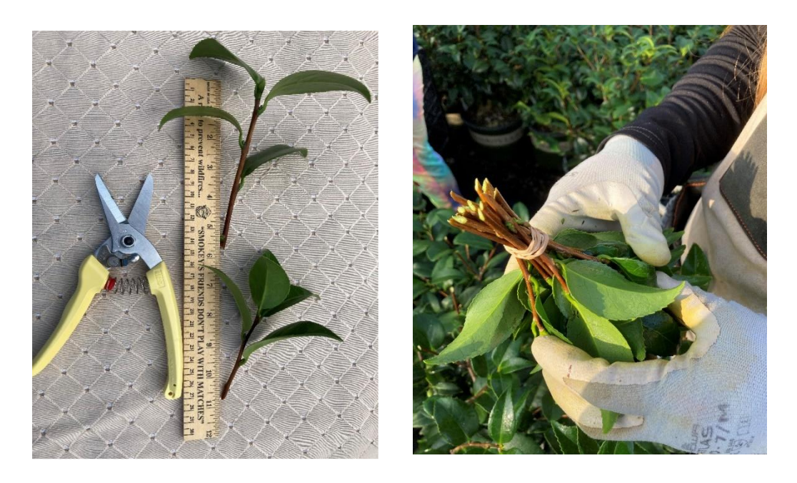
Figure 4. (left) Examples of Camellia japonica cuttings; (right) bundle of cuttings.

Cuttings are bundled into groups of 20 or 25 depending on the size of the cuttings (Fig. 4).