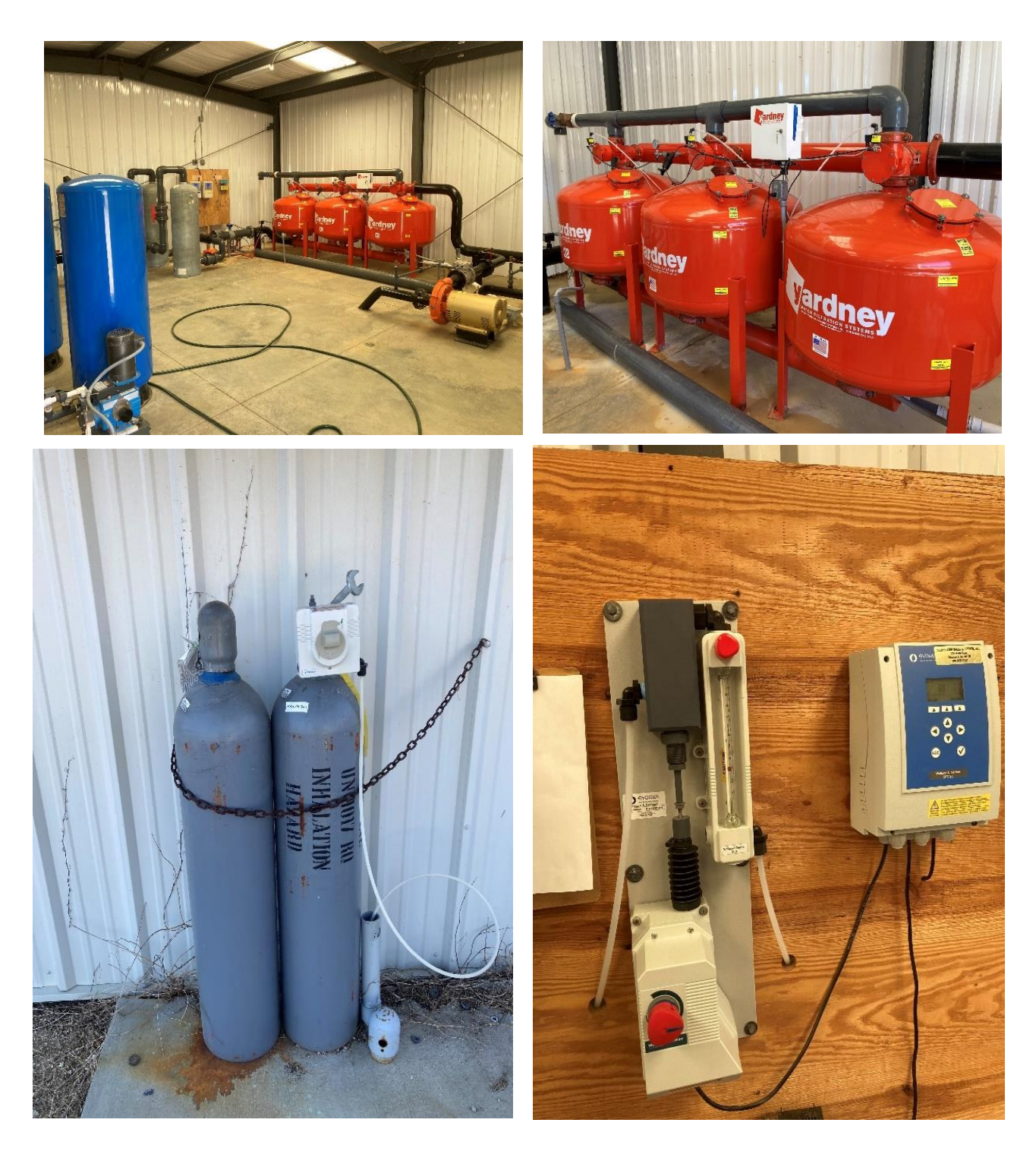
Figure 17. (top left) Interior view of pump house, (top right) a Yardney sand filtration system with automatic backflush, (bottom left) chlorine gas cylinders with a regulator, and (bottom right) a Wallace and Tiernan<sup>®</sup> S10k gas feed chlorine metering system.