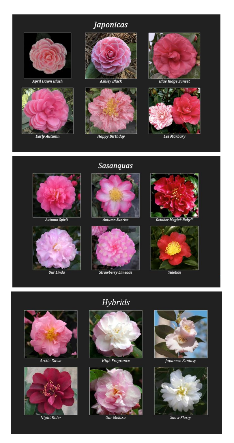
Figure 2. Images of the blooms of a portion of camellias grown at Bennett's Creek Nursery: [C. japonica (top), C. sasanqua (middle), and C. hybrida (bottom).

(Fig. 2). This paper describes the protocol for production of camellias from rooted cuttings.