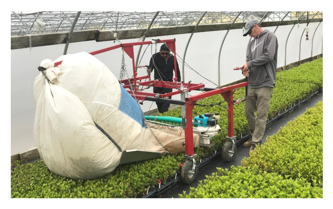
Figure 26. Gas powered sickle bar pruning machine with blower and bag attachment for uniform pruning and debris collection.