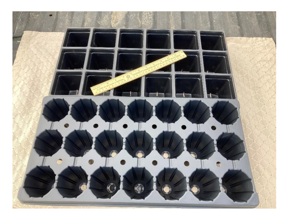
Figure 24. New 18-cell and 21-cell tray inserts.