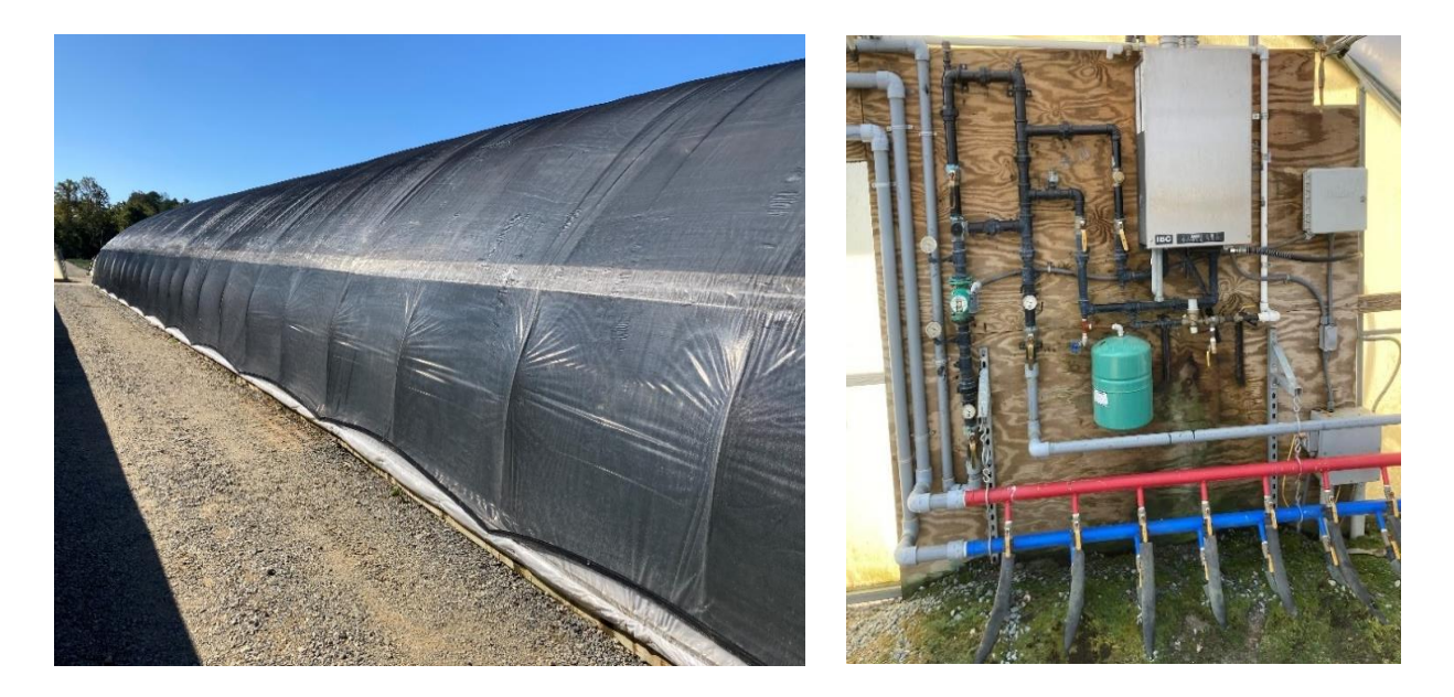
Figure 13. (left) Greenhouses converted for cool season propagation, and (right) wall mounted propane fired hot water heating system.