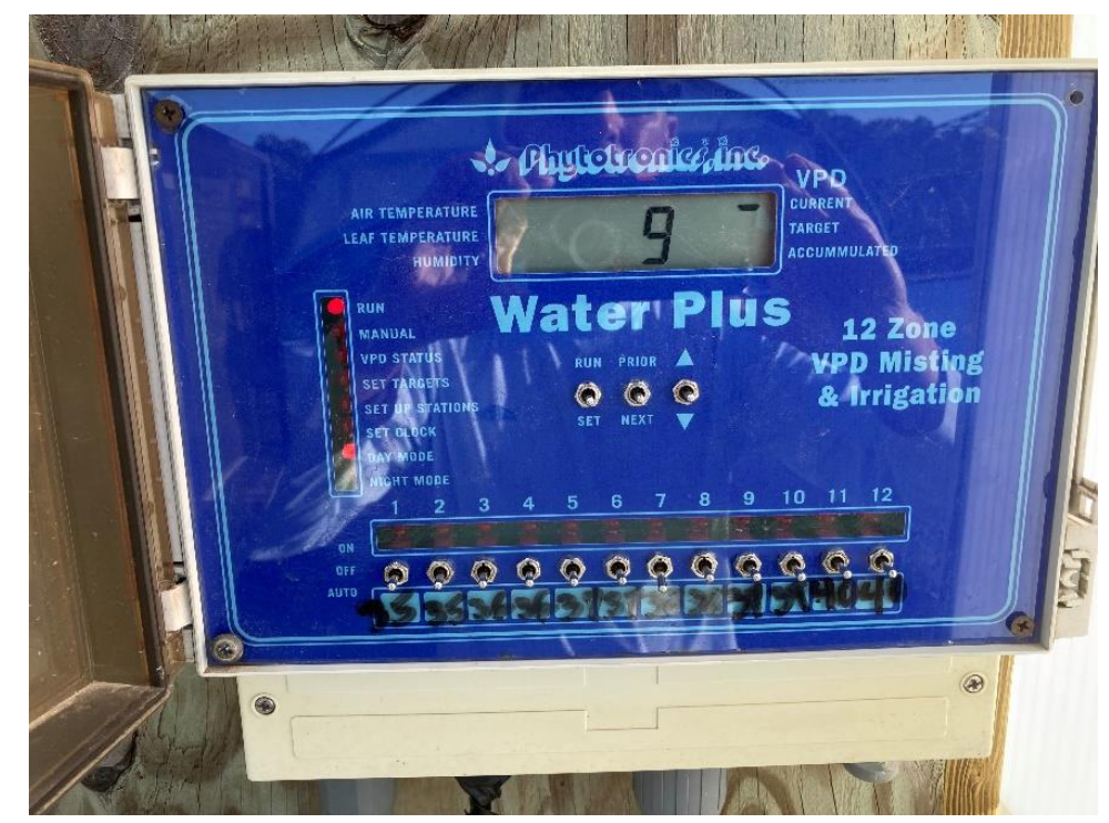
Figure 14. Phytotronics 12-zone vapor pressure deficit (VPD) controller.