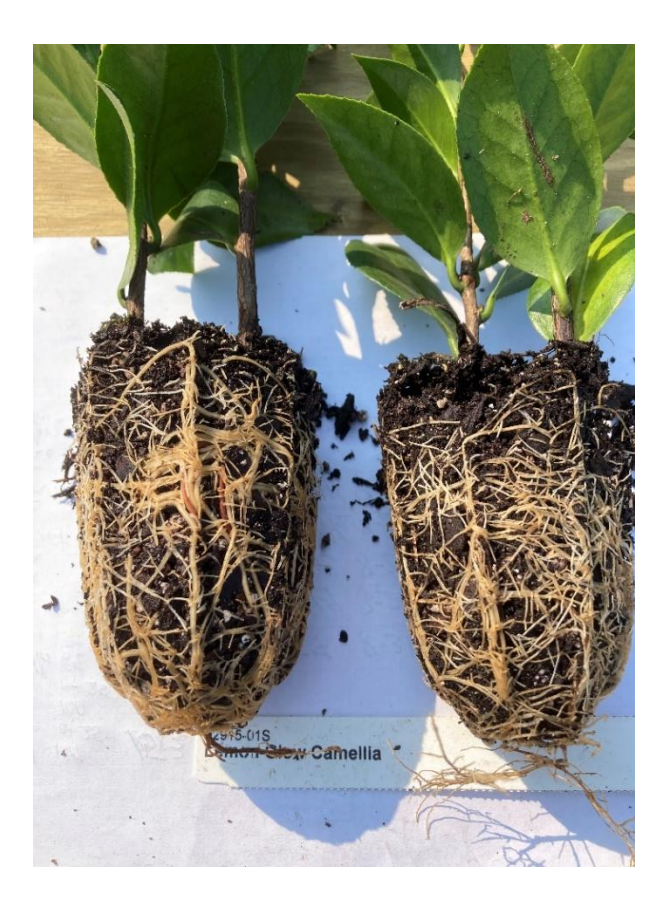
Figure 28. Well branched healthy camellia root systems.