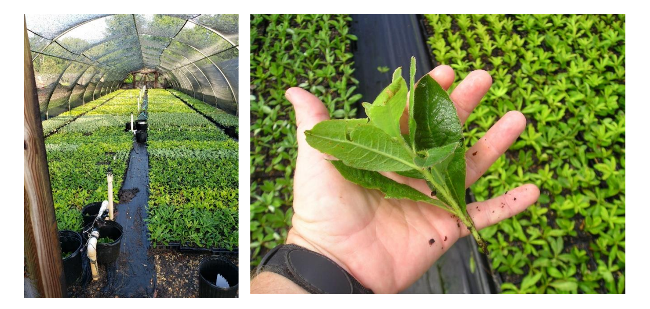
Figure 15. Propagation of deciduous azaleas using soft to semi-soft wood cuttings.

then it is too late; rooting percentages will drop by 50%. Additionally, we take deciduous Ilex species early. We get better rooting, and the rooted liner has more time to develop a flush of growth. As with native azaleas, an Ilex that roots but does not flush will have a difficult time breaking dormancy the following winter. We root lepidote and elepidote Rhododendron in April as well. They are another group that will sit for a long time under mist and then suddenly throw a pot full of roots. Be patient.