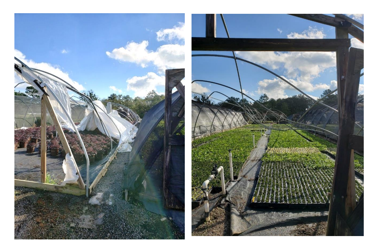
Figure 8. On 24 October 2020, Hurricane Zeta destroyed eight Quonset houses.