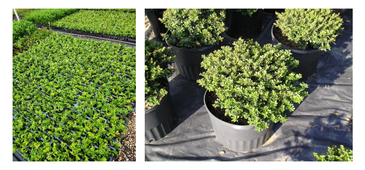
Figure 16. Semi-hardwood cuttings used to propagate (left) Distylium 'Spring Frost', (right) Ilex vomitoria 'Oscar Grey'. Ilex vomitoria and Chaenomeles require no rooting hormones, whereas Berberis , Cliftonia and Distylium are treated with 2500 ppm K-IBA.