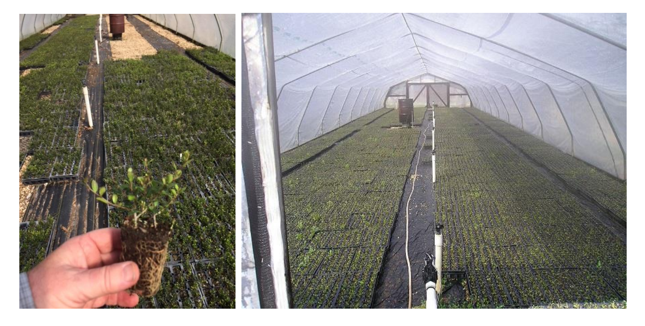
Figure 18. Propagation of Ilex vomitoria .

Our Cleyera seed is ripe in September. We discovered that rotting the seed in a mist house for three weeks after picking seed gives us much better germination rates; but it is a stinky job to screen and wash them. We sow them in flats with no fertilizer with a light covering of perlite.