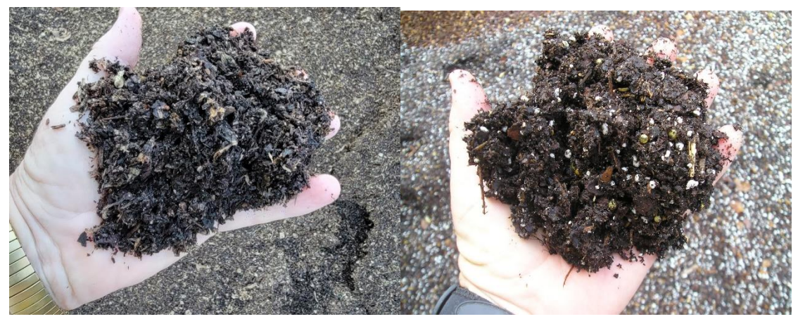
Figure 4. Soil mixes. (left) The general soil mix of 3 bark: 1 peat: 1 pine shavings; and (right) for conifers, the mix is 3 bark: 1 peat: 1 pine shavings: 1 perlite.