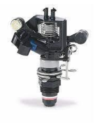
Figure 6. (left) Phytotronics 1626 Clock<sup>®</sup> controller (arrow) can mist up to 6-zones <u>https://www.phytotronics.com/product/nova-1626et-6-zone-controller/</u>. (right) Our sprinklers include the Rainbird Maxi Bird<sup>®</sup> at 3-gal per minute, and Senninger Mini-Wobblers<sup>®</sup>.

There is no substitute for personal attention in propagation. No amount of sophisticated gadgetry will replace a good propagator. As a safety precaution, we hang two-sided plastic flags on our clock boxes. One side is green, the other side is red. We check our timers at 8:00 and, if all is well, we hang the green flag on the clock box. We check again that the houses are cycling properly at 10:00 and 14:00. At 16:00 we make one final round and take off the flag. If during the day an employee needs to turn off a house, they are required to flip the flag from green to red. We are all human! I cannot tell you how many times in 35 years I have seen houses turned-off. Here at van der Giessen - turning off a clock without red flagging it - is a capital offense. That five-cent piece of plastic has saved us tens of thousands of dollars.