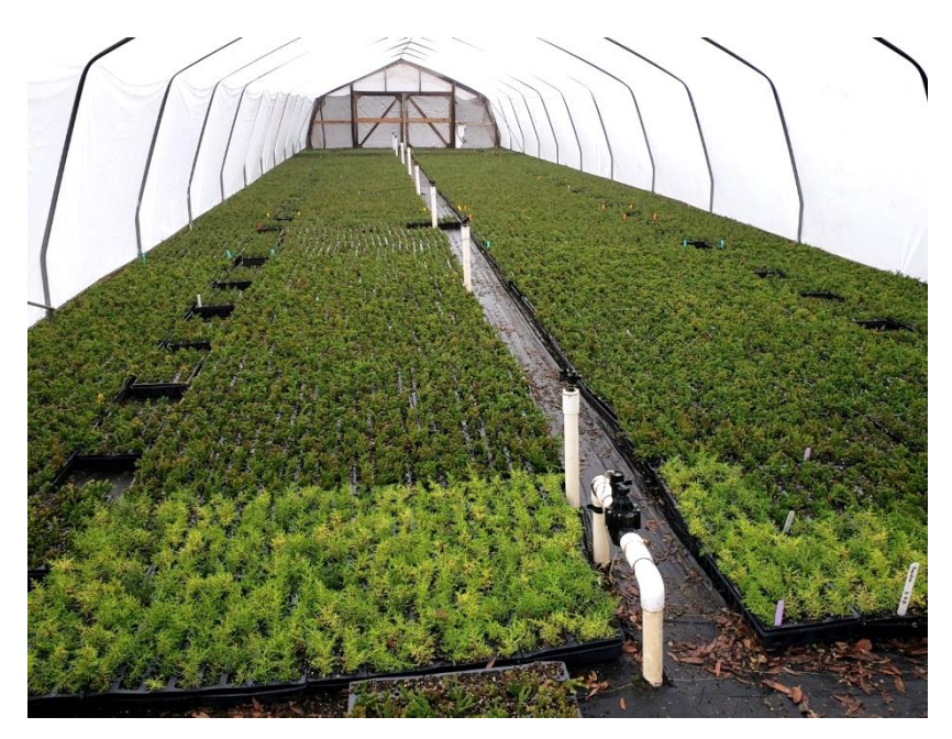
Figure 14. Propagation of Cephalotaxus in March.

It is not uncommon for a crop to sit for three to four months before they begin to root in good percentages. We keep the house covered in white poly and syringe three or four times a day. We typically get 80% rooting. This is insufficient for liner production. Consequently, this crop is later transplanted into quarts for sales.