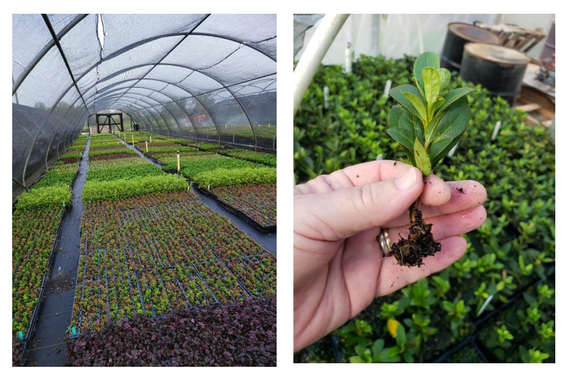
Figure 10. Proper seasonal timing of collecting cutting wood is critical in propagation.