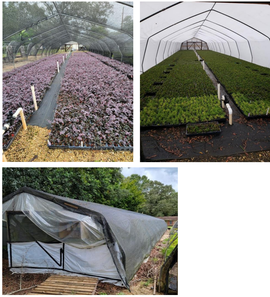
Figure 7. Our Quonset propagation house coverings alternate from (top, left) 55% saran with no poly from April through October; (top, right) white poly from January through March, and (bottom) clear poly with 55% saran from October through December.

Labor costs have increased by almost 70% in the past fifteen years. During the same period our pool of available labor has shrunk dramatically. Plant pricing in the industry has not kept pace with production costs. This has driven the industry to find ways to cut costs. At van der Giessen, we worked with Ellis Manufacturing to build a 15-bit drill-head for our potting machine capable of producing jumbo quarts (Fig. 9).