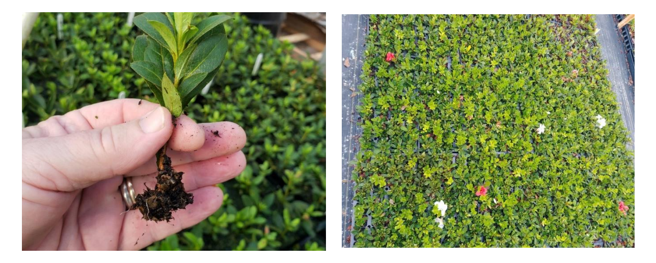
Figure 17. Semi-hardwood cuttings of evergreen azaleas are neither stripped nor quick-dipped with auxin.

year. We no longer strip our cuttings nor cut the tips.