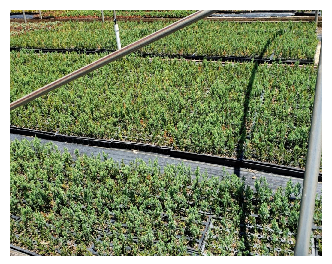
Figure 11. Dividing conifers into easy- and difficult-to-propagate species.