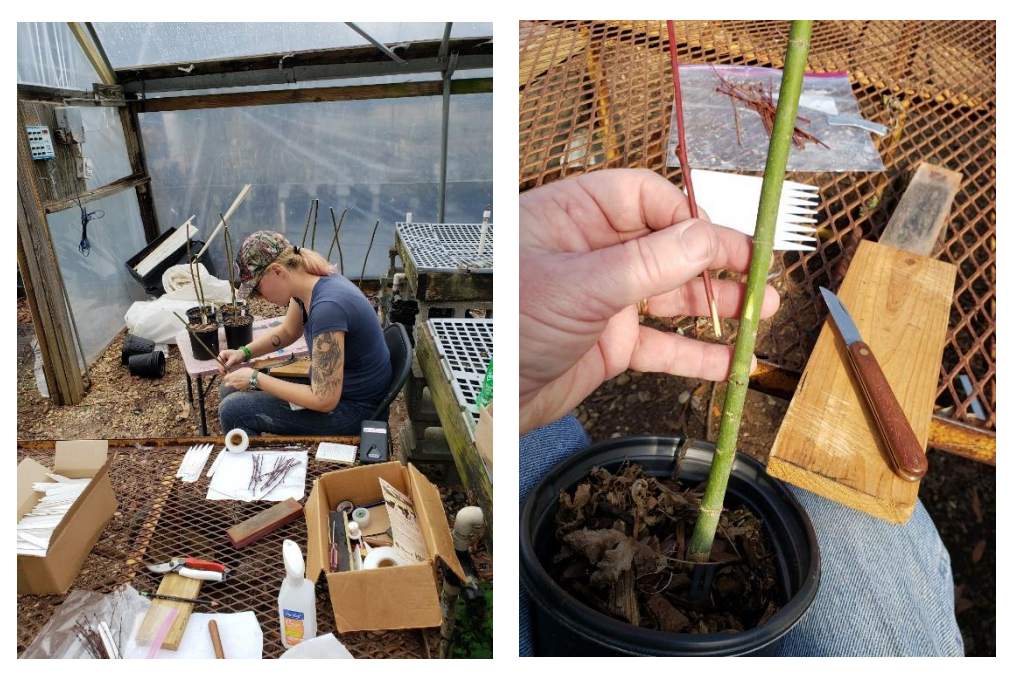
Figure 13 . (left) Bench grafting maples using a side veneer graft (right, arrow). The darker, smaller scion piece is held in the grafter's hand.