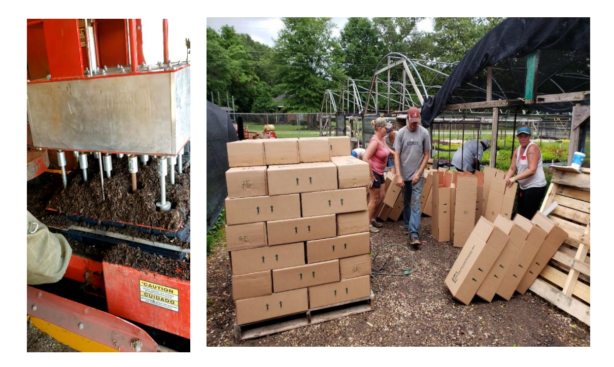
Figure 9. (left) Ellis Manufacturing built a 15-bit drill-head for our potting machine capable of producing jumbo quarts. (right) We can box and palletize the quarts to ship with our liners.