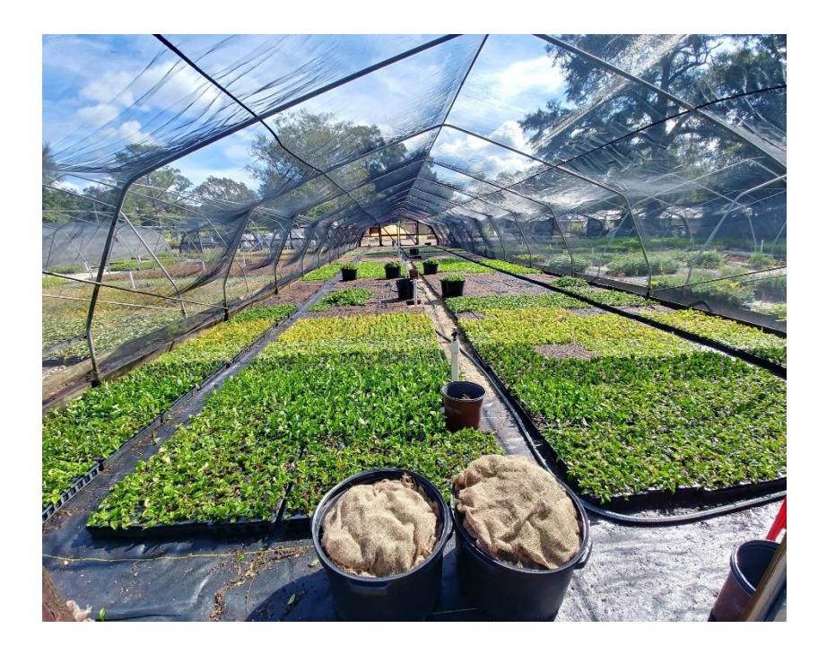
Figure 5. A 7 x 30 m (24 x 100 ft) shaded Quonset house for propagation and rooted-liner production. Each propagation tray contains 40-cells 6 x 8-cm ( 2.3 \times 3 -in.)] with 1100 trays per house - and 44,000 liner plants.

be changed out in five minutes or less, and does not require a manual to operate. Our propagation sprinklers are either the Rainbird MaxiBird<sup>®</sup> or Senninger Wobblers<sup>®</sup> (Fig. 6). Both are sturdy, inexpensive, and reliable. We produce liners in 40 cell 1801 flats. A house holds 1100 trays – and 44,000 liner plants.