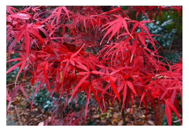
Figure 12. Grafting maples using the side veneer

In February, we graft Acer palmatum and A. japonicum . We bring the understock into a marginally heated house [2-4^{\circ}C (35-40^{\circ}F)] in January. We use a side-veneer graft with grafting tape. We do not bag. We have a 90% success rate. We graft onto our understock at the second or third node above the soil.