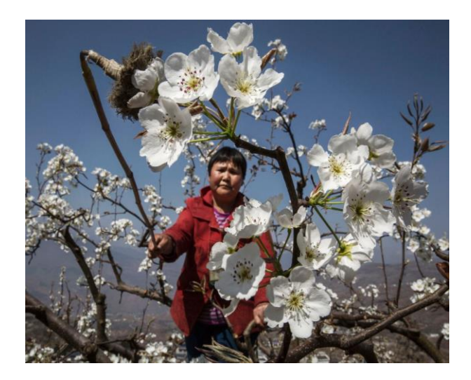
Figure 2. Hand pollination of temperate fruit crops is done in parts of China because insect pollinators have been killed off.

What if we showed him how many chemicals it takes us to produce unblemished fruit and vegetables that we consume and feed our children? What if he saw that we were destroying our pollinators by spraying all these chemicals? In some areas of China, they have killed off most of their pollinators. They literally take a sack of pollen and a stick with chicken feathers on it and climb up into the fruit trees and pollinate each of the flowers (Fig. 2). I was born and raised in central Florida so citrus is near and dear to my heart. What if he saw the methods we have resorted to keep insects off of our citrus trees (Fig. 3)? Is this really the best we can come up with as craftsmen of our trade? Is this the best we can come up with as a civilization? I think not!