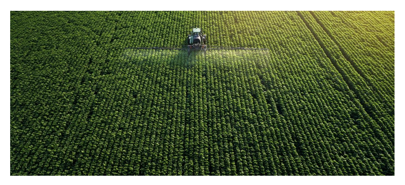
Figure 1 . Cotton Farming is universally recognized as one of the most chemical-laden crops on the planet.

Cotton is considered one of the 'dirtiest' crops on the planet in terms of the amount of chemicals and pesticides used to grow it (Fig. 1). What if we tell our hero that we make clothes, bed sheets and bath towels out of this cotton? Then the rest of the plant is utilized for cooking oil and animal feed. https://www.moderndane.com/blogs/the-modern-dane-blog/why-cotton-is-called-the-worlds-dirtiest-crop