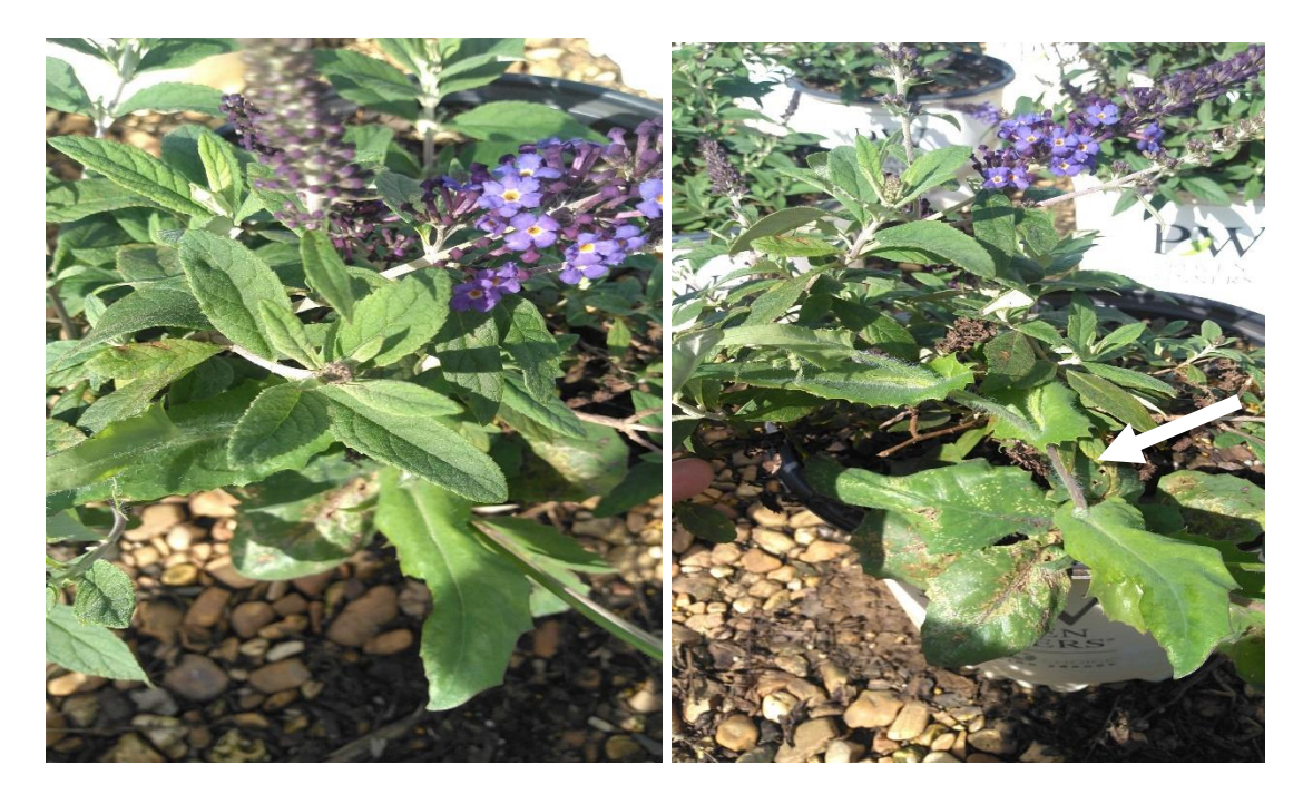
Figure 7. (left) A healthy young Buddleia and (right) a weed (arrow) growing in the same container as the Buddleia but gradually succumbing to a foliar pathogen.

Optimum fertility can mitigate weeds. See the example of a healthy young Buddleia and a weed in the same container - succumbing to a foliar pathogen (Fig. 7). The weed being attacked by a pathogen is an indicator that the container nutrition program is balanced. The intended crop is healthy and pathogen-free, while the weed is susceptible to the fungal pathogen. [A dilemma for the green industry is zero tolerance for weeds in container production systems. Weeds in container production are a costly management problem to control via integrated pest management, chemical usage, and expensive hand-weeding].