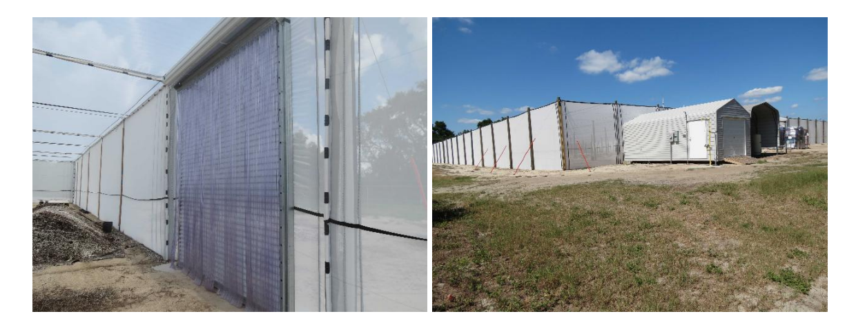
Figure 3. (right) Citrus under protective screen (CUPS). (left) Steel roll-up door with a second plastic strip door, and (right) citrus can be grown under protective screen structures for fresh-fruit production in order to exclude the Asian citrus psyllid (ACP, Diaphorina citri ) vector of huanglongbing (HLB), or citrus greening disease, and thereby produce disease-free healthy fruit. While CUPS may be economically feasible for some fresh-market citrus crops, over 90% of Florida citrus is for juice production, so a CUPS system is not economically sustainable. https://edis.ifas.ufl.edu/publication/HS1304 Credit: Arnold W. Schumann, UF/IFAS.