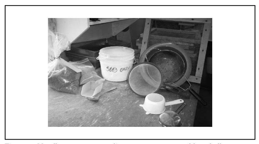
Figure 10. Miscellaneous strainers and/or screens to separate seed from chaff.

Once the purity percentage is known it is possible to accurately calculate the seeds per gram using the following calculation: