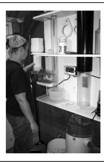
Figure 2. Air separator for cleaning seeds.