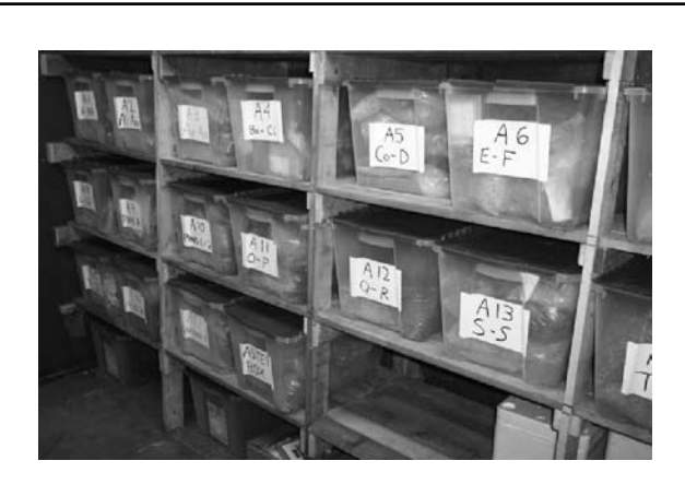
Figure 8. Seeds in individually labeled plastic boxes kept in cool storage.

consists of the final product including about 100 seeds. The following calculation is used to find the purity percentage: