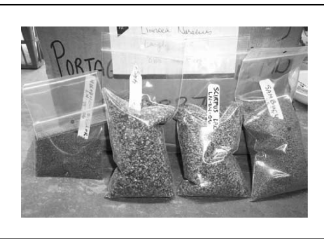
Figure 7. Seeds packaged in clear plastic bags ready for storage.