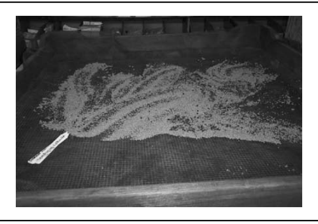
Figure 5. Seeds spread out on a screen for drying.