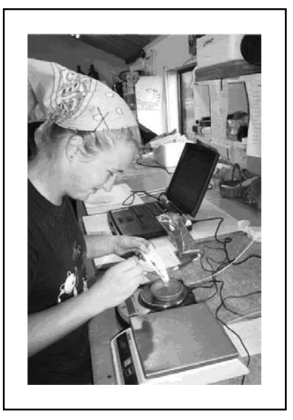
Figure 6. Weighing seeds on an analytical balance getting ready for packaging.

When dry, the seeds are worked, "massaged" gently by hand through miscellaneous strainers and/or screens to separate seed from chaff (Fig. 10). Sometimes pods or other seed structures are put dry through a food processor. The food processor will more or less pulverize the seed mixture, after which the seed can be easily separated with screens, strainers, and/or the air separator. When using screens and strainers, always go from a large mesh to a smaller mesh.