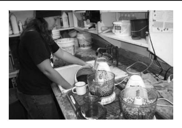
Figure 3. Food processors used for processing seeds found in berries.