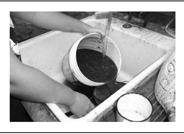
Figure 4. Seed and water slurry resulting from the food processor treatment.

The drying will take from 2–4 days depending on the temperature in the room. By then the seed should be below 10% moisture content and be ready to receive a final cleaning using screens, strainers, or the air separator. When the seed is clean and dry, the following information is recorded and entered into the inventory data sheet: seedlot weight, seed count per gram, processing yield (final clean weight : received weight = grams of clean seed per kilo of received weight), storage location, date, and processing time (Fig. 6).