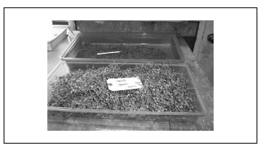
Figure 9. Labeled seeds are dried and cured in open trays.