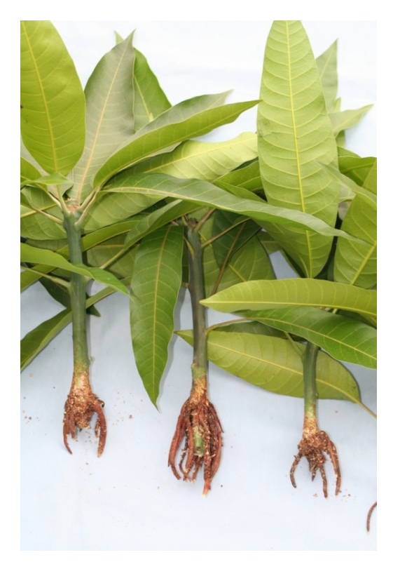
Figure 1. Rooting of air-layered 'Aikou' mango.

In the own-rooted nursery, the air-layer technique was performed using 'Aikou' trees planted in a greenhouse on 8 Sept. 2007. A 1-naphthaleneacetic acid (NAA) solution (2,000 ppm, 50% ethanol) was sprayed on the girdles (width: 2-3 cm) of air-layered branches and covered with polythene bottomless bags. The ends of the branches were then tied with a string. The bags were filled with moist vermiculite, and the tops of the branches were tied with a string. Subsequently, the outside was covered with aluminum foil to prevent high-temperature damage. On 11 Nov., the rooted branches (Figure 1) were removed and planted in a small pot (diameter: 13.5 cm, height: 11 cm). On 21 Aug. of the following year, the own-rooted nursery was planted in pots made of non-woven fabric (25-L pot; diameter: 30 cm, height: 30 cm) and filled with a mixture of mountain soil, perlite, compost, and vermiculite (1:1:1:1, by vol.).