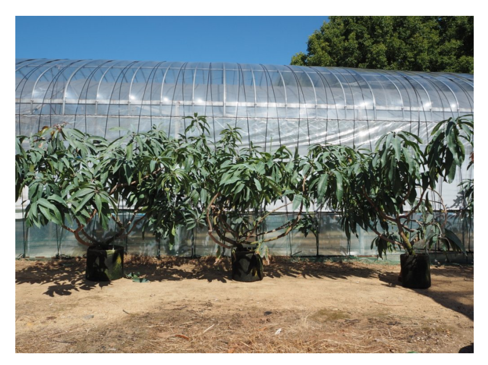
Figure 2. Effects of pot culture soil volume on tree growth in nine-year-old own-rooted 'Aikou' mango trees. Left: 45-L pot, Middle: 30-L pot, Right: 15-L pot.

a minimum temperature of 6°C. This minimum temperature was gradually increased from mid-February, and maintained at 18-20°C from the middle of March until the late of April during the flowering period. A fan was used for ventilation to ensure the internal air temperature remained below 35°C. The plants were watered daily by automatic irrigation. Fertilization, disease control, and pest control were all performed according to conventional procedures.