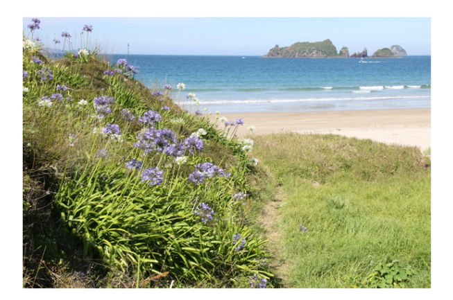
Figure 5. Blue- and white-flowered Agapanthus praecox subsp. orientalis naturalized at Opito Bay on the Coromandel Peninsula.

Wild populations of agapanthus can threaten remnant indigenous ecosystems, and flourish in coastal, frost-free (or lightly frosted) warm temperate climates. Agapanthus is tolerant of a wide range of soil types and growing conditions—from dry exposed environments to damp, lightly-shaded sites. Among other habitats, it has naturalized in coastal areas (Figure 5), along roadsides, and in wasteland. There is no biocontrol available, and (as previously mentioned) it is relatively resistant to herbicides.