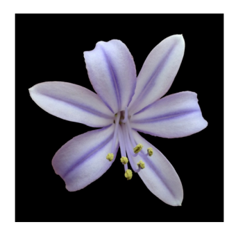
Figure 13. Agapanthus 'Glen Avon', showing a flower with six tepals and six anthers.