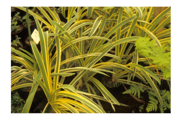
Figure 4. Agapanthus 'Tigerleaf', a variegated green- and yellow-leaved cultivar.

Figure 3. Agapanthus 'Goldstrike', a variegated green- and white-leaved cultivar.