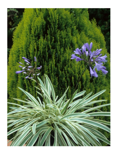
Figure 18. Agapanthus 'Tinkerbell', a cultivar with variegated leaves.

The variegated cultivar, A . 'Tinkerbell' (Figure 18), presents an interesting case in assessing fertility. Like some of the other variegated cultivars, it is an intermittent shy flowerer, and sets little seed per plant on an average season. However, seed set of A . 'Tinkerbell' is moderate per flower head when it does flower.