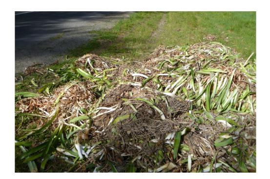
Figure 6. Roadside dumping of Agapanthus praecox subsp. orientalis .

Agapanthus typically produces abundant seed (Figure 7) that germinates readily. This seed can spread by wind and water—particularly along drains and waterways (Figure 8). Deadheading (removing seed heads before the capsules split open) to reduce seed dispersal is timing dependent, and for large areas tedious and impractical.