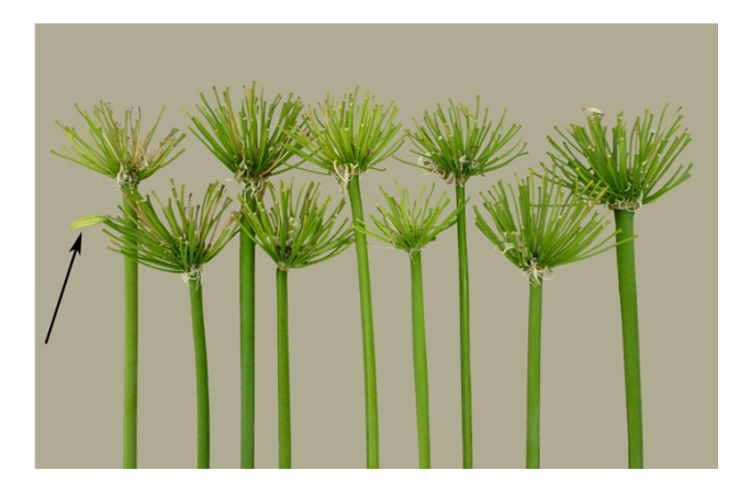
Figure 21. Rare capsule formation on Agapanthus 'Finn' PVR, a confirmed low fertility cultivar.