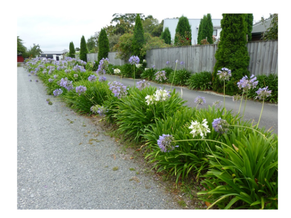
Figure 2. Tall-growing white- and blue-flowered Agapanthus praecox subsp. orientalis planted between driveways.

Agapanthus has resistance to glyphosate (e.g., Roundup<sup>®</sup>) so amenity plantings can easily be kept clean of emerging weeds by spraying the ground around them—agapanthus are not bothered by minor overspray.