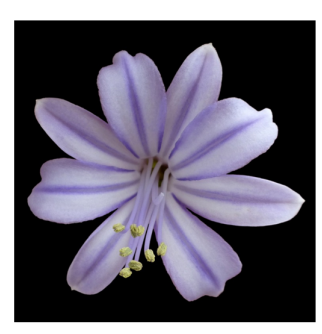
Figure 14. Agapanthus 'Glen Avon', showing a flower with eight tepals and eight anthers. Photo: Murray Dawson.

Figure 13. Agapanthus 'Glen Avon', showing a flower with six tepals and six anthers. Photo: Murray Dawson.