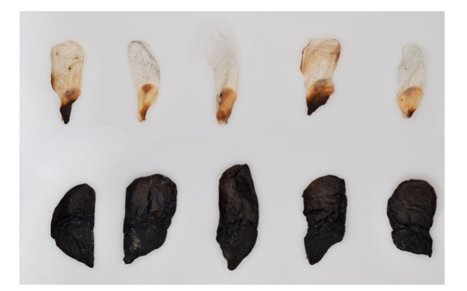
Figure 12. Undeveloped seed in Agapanthus is easy to recognize: upon maturity of the fruit capsule, inviable seed is lighter colored, smaller, and flattened (top row). In contrast, filled, "viable" seed is black / dark brown and broader (bottom row).

Adoption of "Ecopanthus<sup>™</sup>" for certified low fertility agapanthus cultivars would rely on agreement within the nursery industry and availability of the NZPPI trademarked name to all growers. There would also need to be agreed exemptions for certified low fertility agapanthus from regulatory authorities (such as exemptions within regional councils' RPMP's and potentially in the New Zealand Ministry of Primary Industries NPPA listings) that may ban propagation, sale, and distribution of the fertile counterparts.