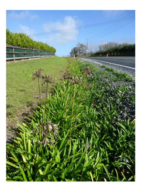
Figure 8. Agapanthus spreading along a drainage ditch, outside of a lifestyle block, north of Auckland city. Photo: Murray Dawson.

Figure 7. Mature head of a typical high seed set, tall-growing Agapanthus praecox subsp. orientalis . Photo: Murray Dawson.