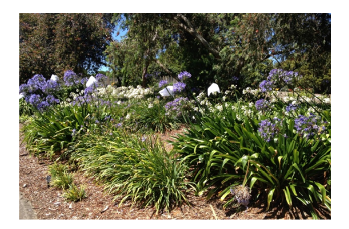
Figure 11. Agapanthus cultivar trials at Auckland Botanic Gardens, January 2017.

Open-pollinated seed set observations from the ABG trials were complemented by Murray Dawson who made separate observations for an agapanthus collection grown in glasshouses and shade-houses at Manaaki Whenua Landcare Research, Lincoln, Canterbury. Observations from both locations (Auckland and Canterbury) were made each fruiting season from 2012 until the present time (2017).