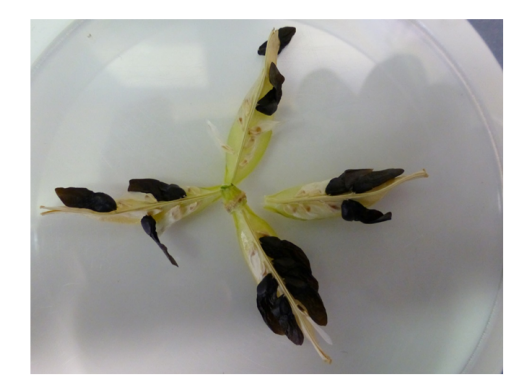
Figure 19. Dissected four-locular capsule of Agapanthus praecox subsp. orientalis providing a comparison of the dark, broad, presumed viable seed with light colored, smaller, inviable seed.

The tall-growing "wild-type" ( A. praecox subsp. orientalis ) typically has a three-locular seed capsule (and occasionally four-locular; Figure 19). Each typical locule has the capacity to physically house up to eight seeds: 8×3 = up to 24 seeds per capsule.