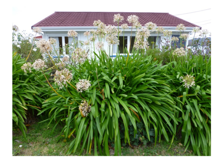
Figure 20. Large plant in seed of Agapanthus praecox subsp. orientalis , from Diamond Harbour, Canterbury, June 2016.

A more rigorous survey of tall-growing agapanthus was undertaken in Auckland, where 100 open-pollinated seed heads were collected from plants growing around the city, and an average of 10 fully formed (dark colored) seeds in each capsule was obtained. This equates to an average of 41.7% seed set per (24-place) capsule (the range was 33-96%).