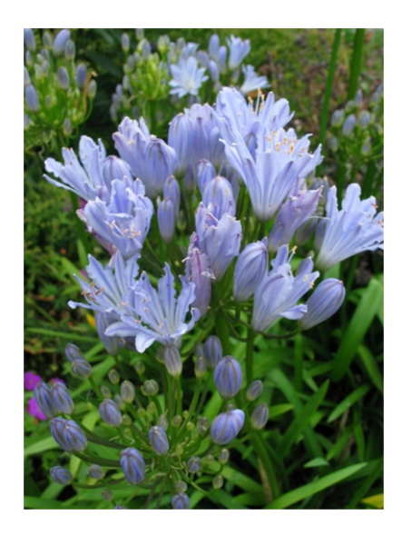
Figure 10. Agapanthus 'Sarah' PVR, a low fertility cultivar with soft blue flowers.

These techniques quantified male (pollen) and female fertility (seed set and germination), and confirmed low seed set in A . 'Finn' PVR and A . Sarah' PVR. However, as both were found capable of producing germinable seed neither could be described as sterile or seedless. The results of this work were presented as a technical report (Ford and Dawson, 2010) and popular articles (e.g., Dawson and Ford, 2012), and pointed the way to future research and fertility assessments.