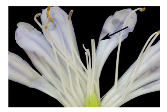
Figure 17. Split styles (arrowed) and deformed stigmas, aberrations typical in the flowers of the low fertility cultivar Agapanthus 'Sarah' PVR.

Table 1 shows that sterility/very low seed set among the 10 cultivars listed is closely associated with dwarf selections, variegated foliage, and/or abnormal flower parts including multi-tepals (low fertility can occur in plant groups where anthers and other floral parts are converted into additional petal-like structures, disrupting normal functioning) (Figures 15-16) and aberrant stigma/styles (Figure 17).