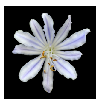
Figure 16. Agapanthus 'Sarah' PVR, a low fertility cultivar showing a flower with ten tepals. Photo: Murray Dawson.

Figure 15. Agapanthus 'Snowdrops', a low fertility cultivar showing pataloid conversion of anthers creating an inner whorl of additional floral parts. Photo: Murray Dawson.