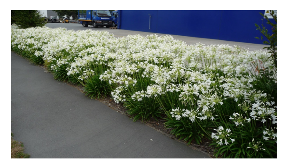
Figure 1. Mass planting of a medium height white-flowered agapanthus cultivar to enhance an industrial street front.

They are useful garden, container and amenity plants used for mass plantings in herbaceous borders, along driveways and roadside banks, and on traffic islands (Figures 1 and 2).