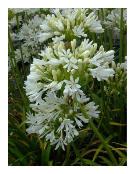
Figure 9. Agapanthus 'Finn' PVR, a low fertility cultivar with white flowers.

Consequently, Auckland Council funded Manaaki Whenua Landcare Research to independently study and quantify fertility of agapanthus. Sterility and low fertility claims made of two dwarf cultivars, A . 'Finn' PVR (Figure 9) and A . 'Sarah' PVR (Figure 10), were used as exemplars and studied in detail. They were compared against tall-growing A. praecox subsp. orientalis and the fertile dwarf cultivar A . 'Streamline'. A wide range of techniques were used, to determine the levels of both male and female fertility, including pollen staining, pollen-tube germination, artificial crossing experiments (self, sib and outcrosses), seed counts and germination rates.