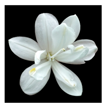
Figure 15. Agapanthus 'Snowdrops', a low fertility cultivar showing pataloid conversion of anthers creating an inner whorl of additional floral parts. Photo: Murray Dawson.

Figure 14. Agapanthus 'Glen Avon', showing a flower with eight tepals and eight anthers. Photo: Murray Dawson.