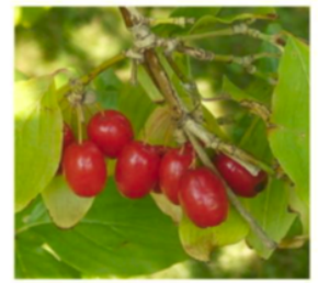
Figure 2. Cornus mas plant, flowers, and fruit.

For plant evaluation, selections and breeding, germplasm is collected from three different methods including: