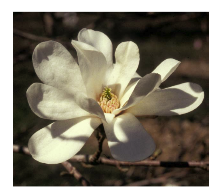
Figure 3. Spring Welcome ^{\circledR} magnolia.