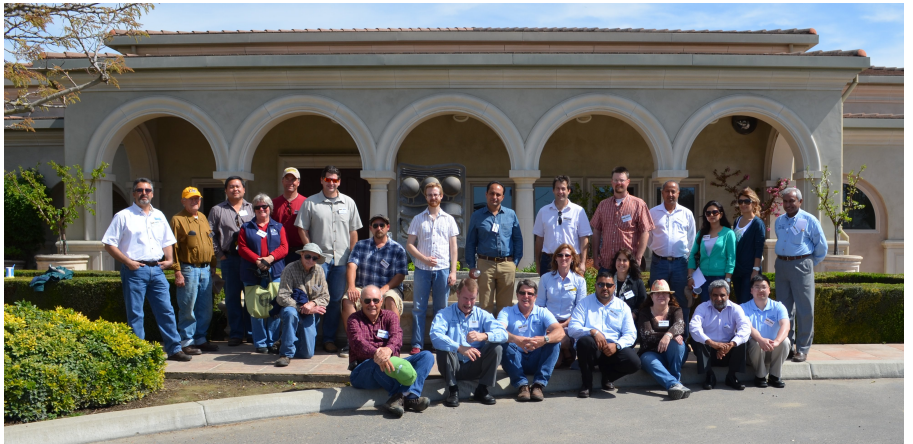
Group photo of participants of the Modesto area meeting.

The participants proceeded to the annual flower show organized by the Modesto Camellia Society at the Administrative Block of Ernest and Julio Gallo Winery in their own vehicles. There were hundreds of varieties of camellia blooms at display from some ordinary to others that were unique, but all were fresh and provided a great mass effect at the show. There were some camellia plants available for sale and some of our participants made use of this special opportunity.