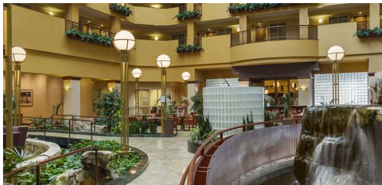
Embassy Suites - Portland Airport

Portland is home to Pioneer Courthouse Square directly across from the original County Courthouse which is where Portland lights its Christmas tree and holds many civic events and celebrations.